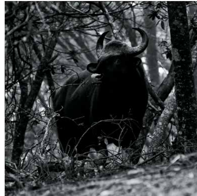
Gaur Bos gaurus , Palani Hills