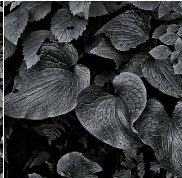
(From left to right) Ferns Kodachadri Cobra Lily Arisaema sp. , Palani Hills New Growth Kodachadri