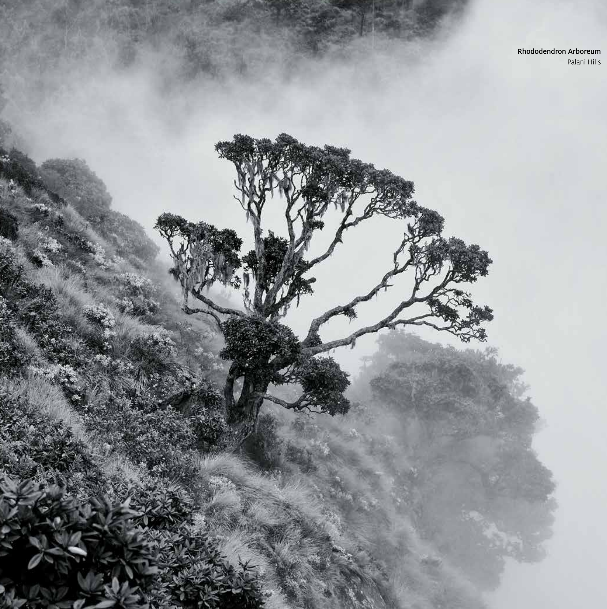
Rhododendron Arboreum Palani Hills