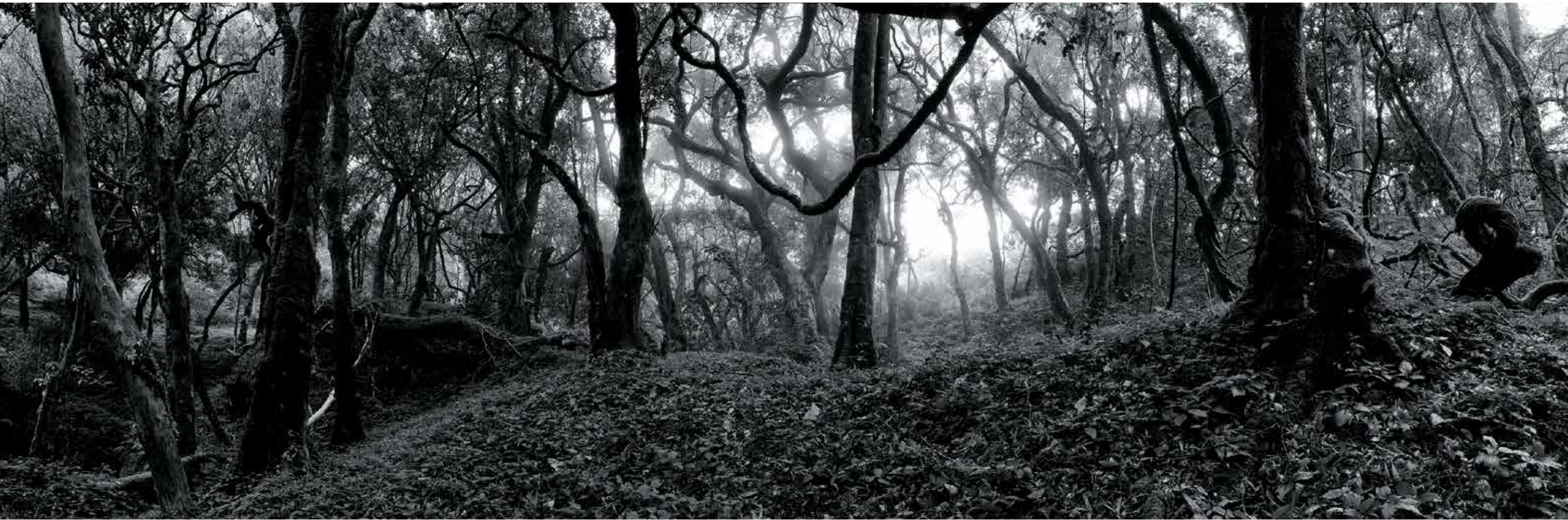
Shola Interior Vaccinium sp.