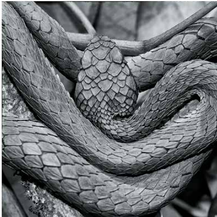
Large-scaled Pit Viper Trimeresurus macrolepis , Palani Hills