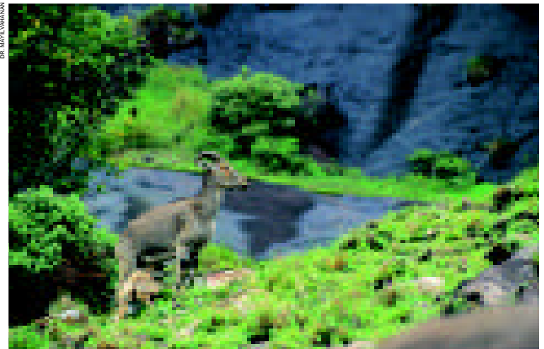
Tahr habitats must be defended from timber and animal poachers and also from illegal marijuana plantations.

The Rajamalai tourist zone is not a pleasant place to be on a holiday, let alone any day during the winter dry spell. Buses, cars and the omnipresent auto rickshaws crowd the narrow road. Most tourists do not visit Rajamalai explicitly to see tahr. It is merely one of several frequent stops in a hectic itinerary. "So much money just for seeing a goat?" a confused visitor from Mumbai asked me. In spite of the signs and pamphlets providing information to tourists, National Park rules continue to be violated. On this particular visit I observed several tourists attempting to pet or feed tahr. Shortly after I stumbled across rubbish and broken liquor bottles on the nearby grassy slopes.