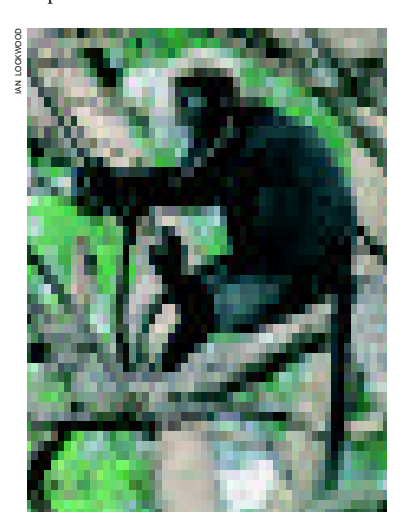
The deep call of Nilgiri langurs echoes through the sholas – the stunted montane forest of the Western Ghats they share with the tahr.

It was pouring when I first pulled up to Eravikulam's check post. I had just encountered a herd of elephants in the maze of tea gardens below the park entrance and I felt an electric sense of excitement in the place. Friendly forest guards offered me shelter while I waited out the storm. Looking through a park pamphlet I learned that Rajamalai, the site of Eravikulam's so-called "tourist zone," has one of the highest rainfall averages of all of peninsular India! When the monsoon hits