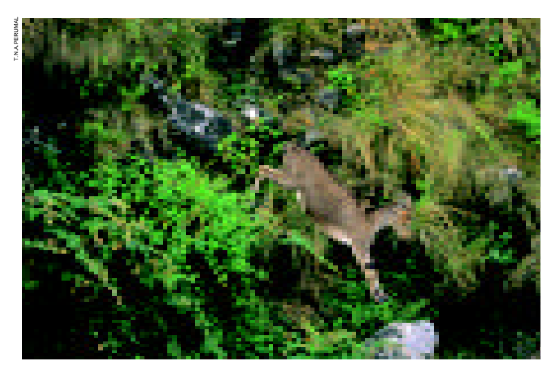
With habitat protection Nilgiri tahr populations near the town of Munnar in Kerala have recovered.

I discovered several point sources on 19<sup>th</sup> century sport and exploration in India.