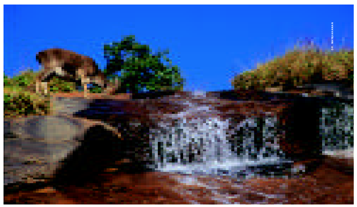
Water shortages are the rule in all hill stations in India and the tahr's habitats should therefore be doubly valued for their contribution to the water security of the Nilgiris.

The tahr at Rajamalai are apparently unperturbed by the close proximity of human beings. Their herds, which frequently swell to extended groups of 100 or more animals, gather around defunct salt licks at the roadside. Much too close, I was convinced, after seeing a young saddleback chewing on a plastic bag taken from a trash can. The growing problem of unregulated tourism has caused much discussion between wildlife officials and people like Changappa. In 1995, entrance rates were increased dramatically from Rs. 2 to Rs. 10! Yet the number of tourists keep growing.